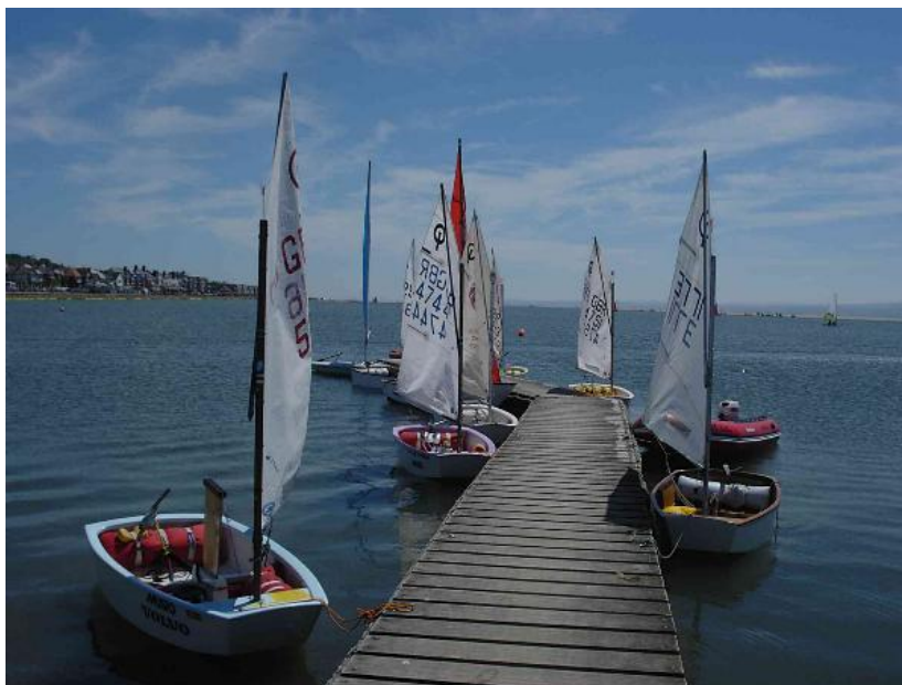
The Junior Dinghy Fleet

Finally remember you are never too old or too important to helm a Mirror. Even our previous Captain and newest Spitfire helm has taken the opportunity to test –drive one, reaching land safely in a vertical not horizontal position!