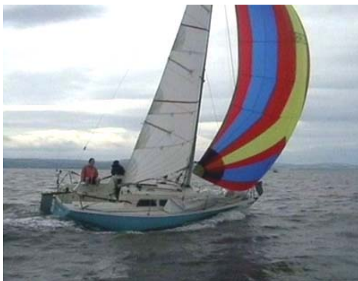
Hunter Delta under Spinnaker

However, this could be a good time for the LBSA to take stock of itself. At present we have 3 Hunter Deltas (price circa £10K) and 2 Super Seals (£15K+) in the fleet.