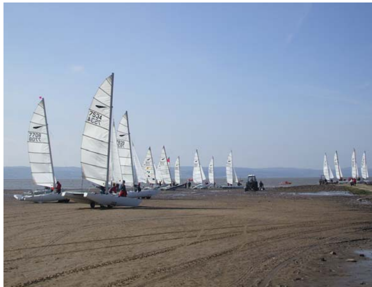
Dart 18's on the Beach at the annual Dart open at Dee.

Singlehanded Championships , 20 th –21 st October, Rutland Water SC